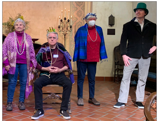
Purim was just one of the fun holidays we celebrated during the Time for All Ages in March.