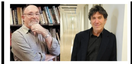
The Unitarian Society of Santa Barbara 1535 Santa Barbara Street